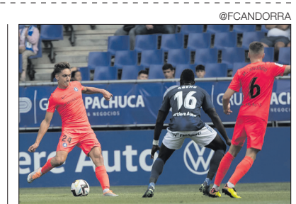
▶► A moment from game.

arriving, we already got goosebumps». FC Andorra thus overcomes the first test, the jump in quality from one category to another, in which for the team «it is a dream and a prize in a year in which we will go out to compete in all places».