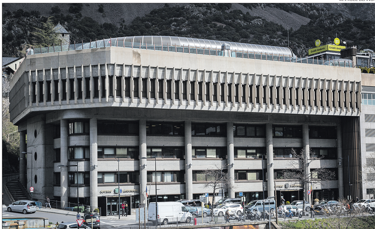
▶ Archive image of the Government's administrative building.

The delay in payment to suppliers has occurred as a result of the lack of staff in the Accounting Department and following the in-