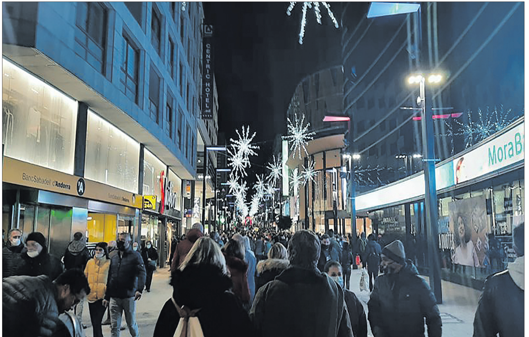
► Archive image of tourists along Meritxell Avenue.