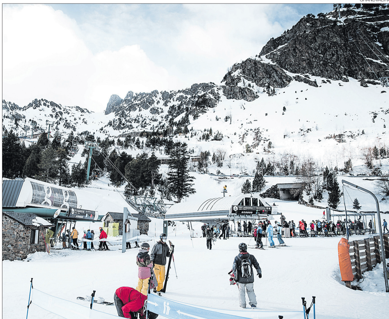
► Customers of the Ordino Arcalis station, during the Christmas festivities.

Regarding the effects caused by the pandemic, Ruiz stressed that «the covid has not been a problem in relation to the influx of guests, who have made cancellations that have been offset by new "last minute" reservations. However, the virus affected the staff of the accommodation, which was largely affected by the numerous infections that the whole country experienced during the Christmas weeks. According to Ruiz, «every day we register two or three workers who leave for covid and this affects the perception of tourists, who complain about the lack of ser-