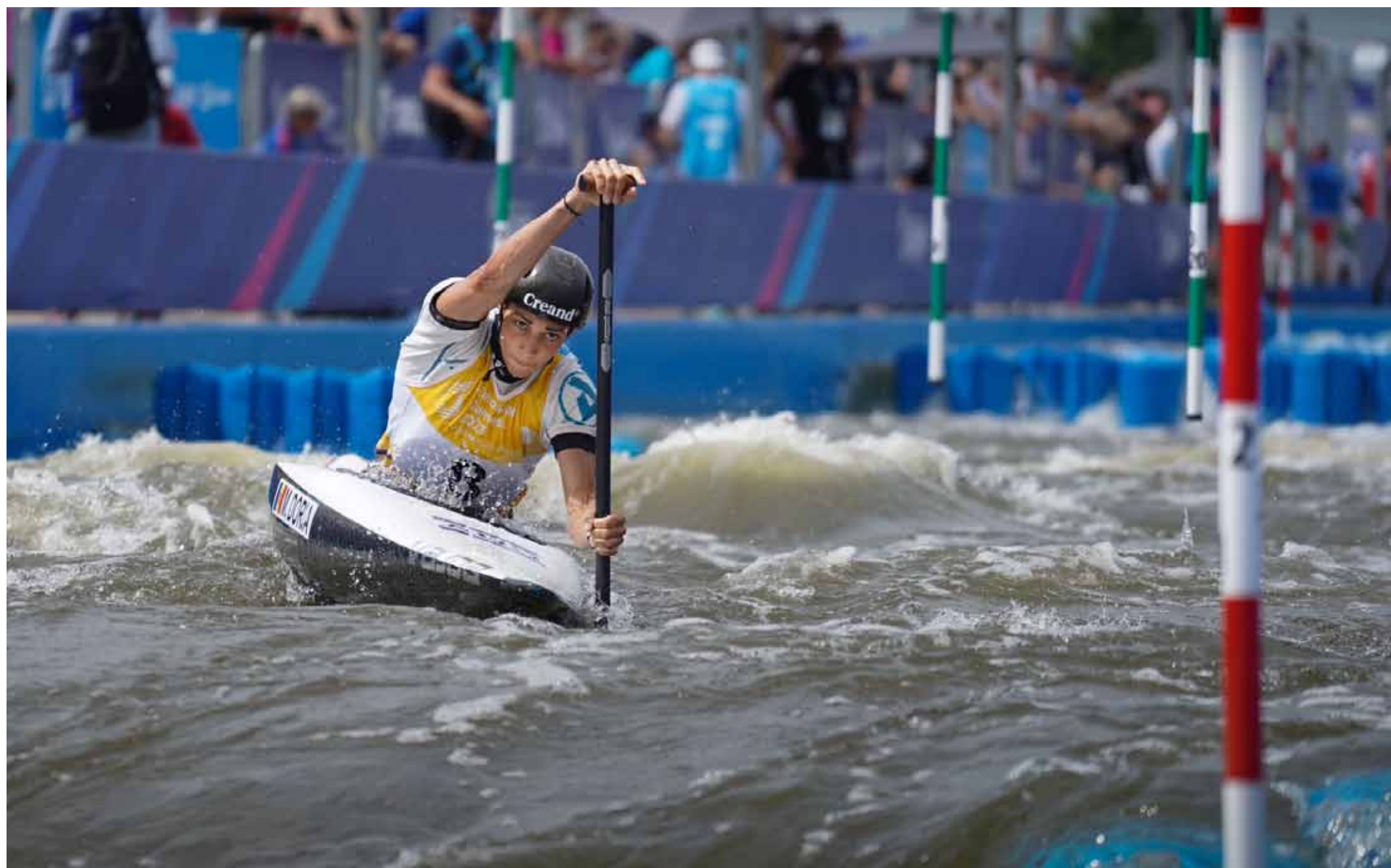
Doria in a stock image.