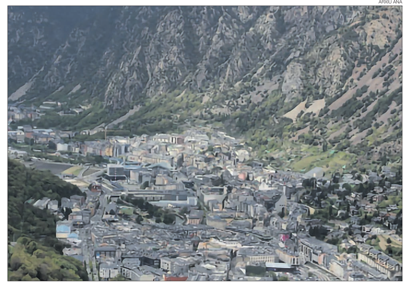
►► An aerial view of Andorra la Vella.

Regarding the demands by parishes, the residents of Andorra la Vella have represented 39.8% of the aid, having received 40.9%