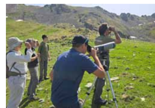
A moment of the Sorteny Valley.

ble for explaining the characteristics of the fauna. Departures are from the park car park and cost 15.68 euros for adults and 7.32 euros for children aged 8 to 12. The activity can be booked through the website www.visittordino.com .