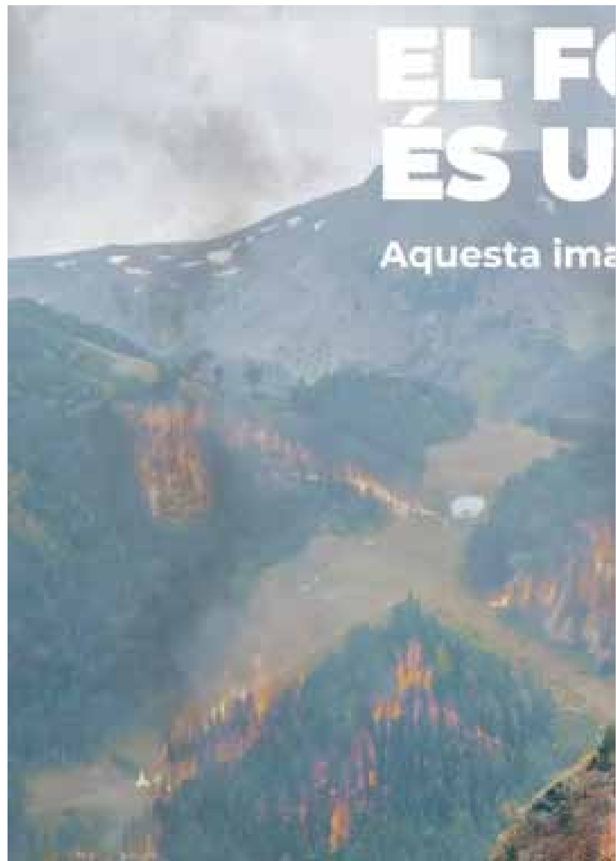
Image of the campaign 'Fire is not a game', promoted by the Department of Civil Protection.

der to raise public awareness of the consequences of the fire. In addition, and questioned the reason for the choice of the Vall d'Incles as the setting for the campaign, the department has stated that «we wanted to focus attention on emblematic places in the country to involve all the parishes of Andorra», as well as “to get closer to