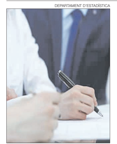
▶▶ Imatge d'arxiu.

In 2022, a total of 186 tons of wood were produced, thanks to the use of forests. A number equal to 38% less than the previous one, being the lowest since 2017 and assuming a decrease for the third consecutive year. For parishes, this year La Massana has produced the most wood (40.3%), followed by Encamp (34.4%).