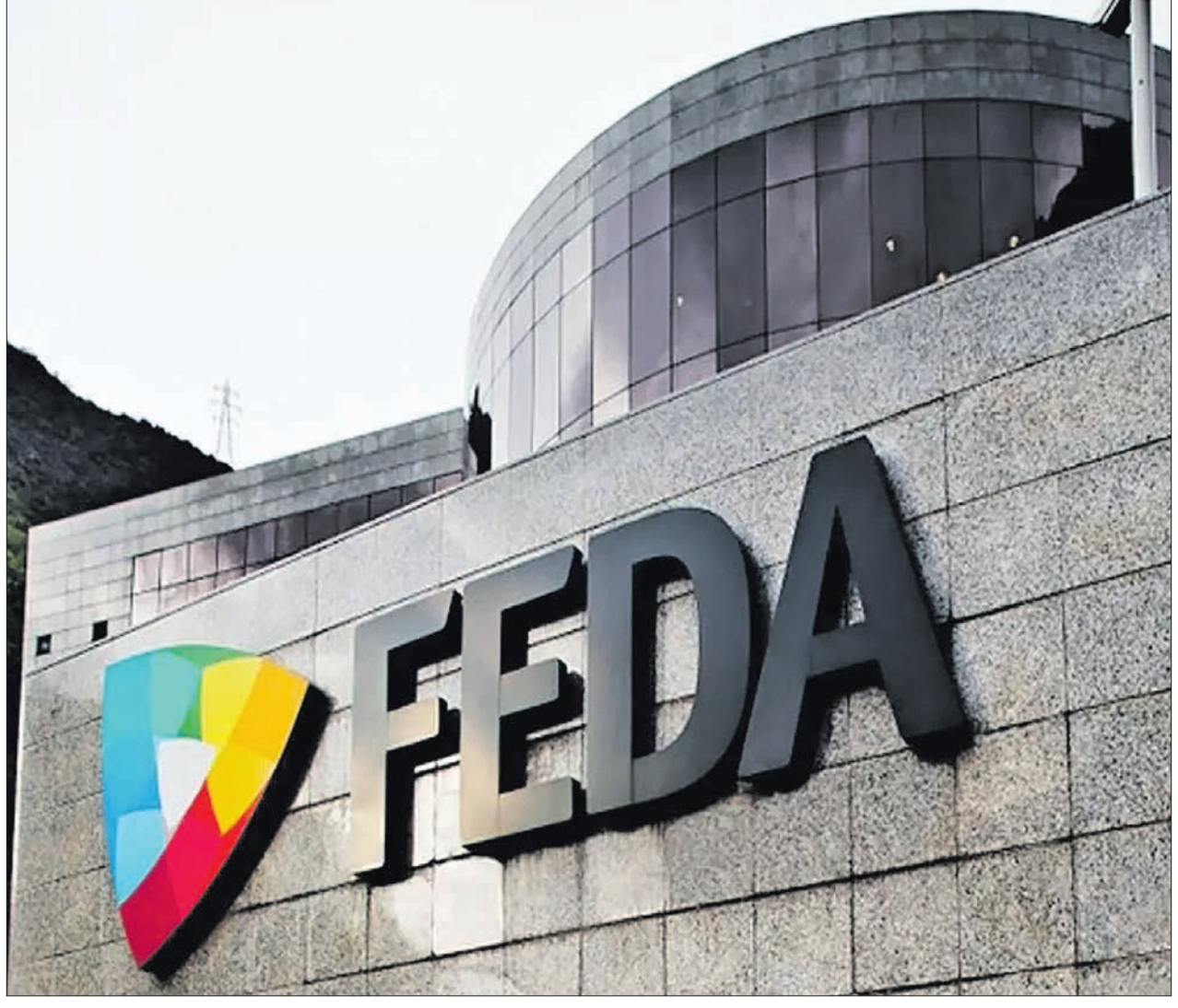
▶▶ FEDA headquarters.

economy has experienced a high growth in the volume of commercial exchanges goods with the outside. Imports of goods in 2022 exceed by 60% those of twenty years ago, while exports exceed 100% of those made at the beginning of the 2000s.