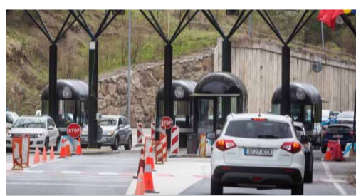
The Hispano-Andorran border.