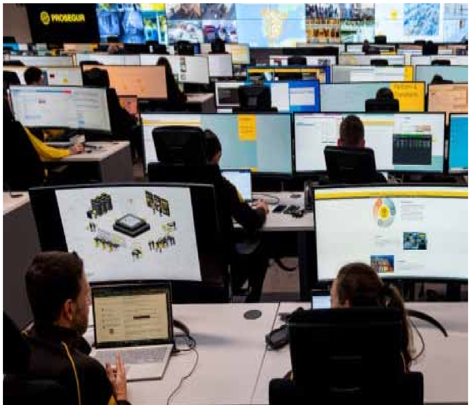
Image of Prosegur's facilities.

The inauguration of the technology center means the creation of dozens of jobs, with a highly qualified technical profile, specialized in the management