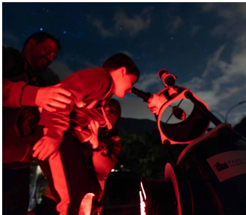
Moment of the Andorra Comapedrosa Astronomy Festival 2024.

On the one hand, the double star Albireo, one bluish and the other yellowish; and, on the other hand, Mizar, a star located within the constellation of the