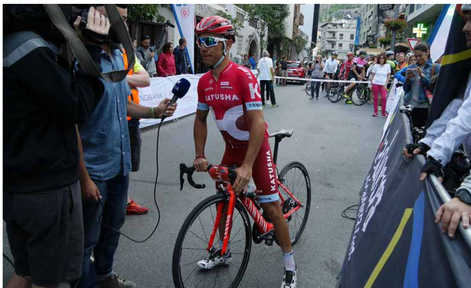
Interview with 'Purito' in 2016, when he was a captain of the Russian team Katusha.