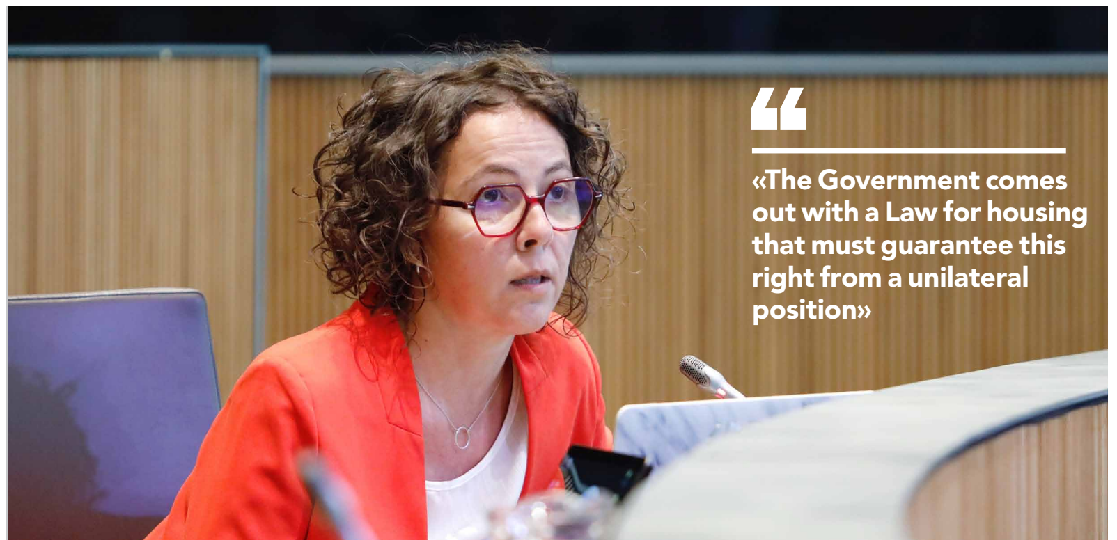
The president of the social democratic parliamentary group, Judith Casal.

In addition, the president of the social democrats adds the lack of political anticipation as one of the causes of the housing problem, exposing in front of the chamber what happe-