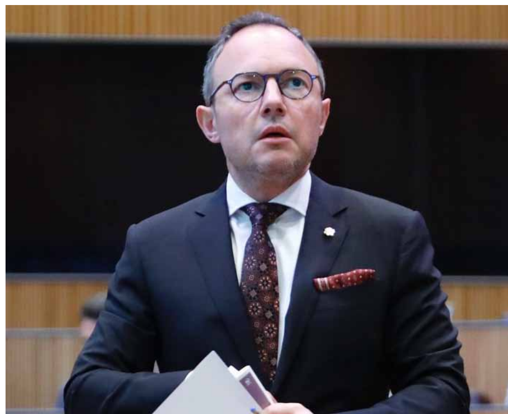
The head of government, Xavier Espot, last Thursday.

Your leading real estate agency in Andorra.