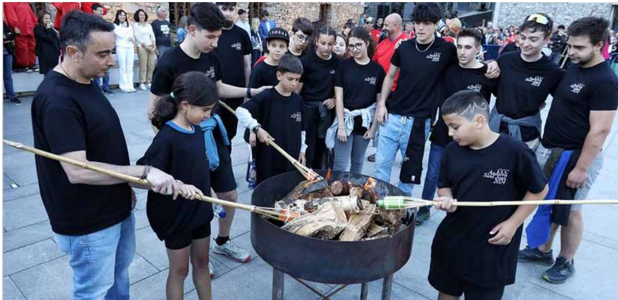
The fallaires with the Canigó flame.