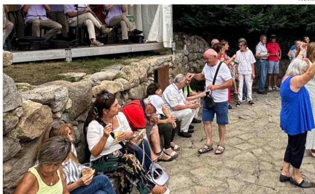
The ballad of sardanes in the main square of Santa Coloma.