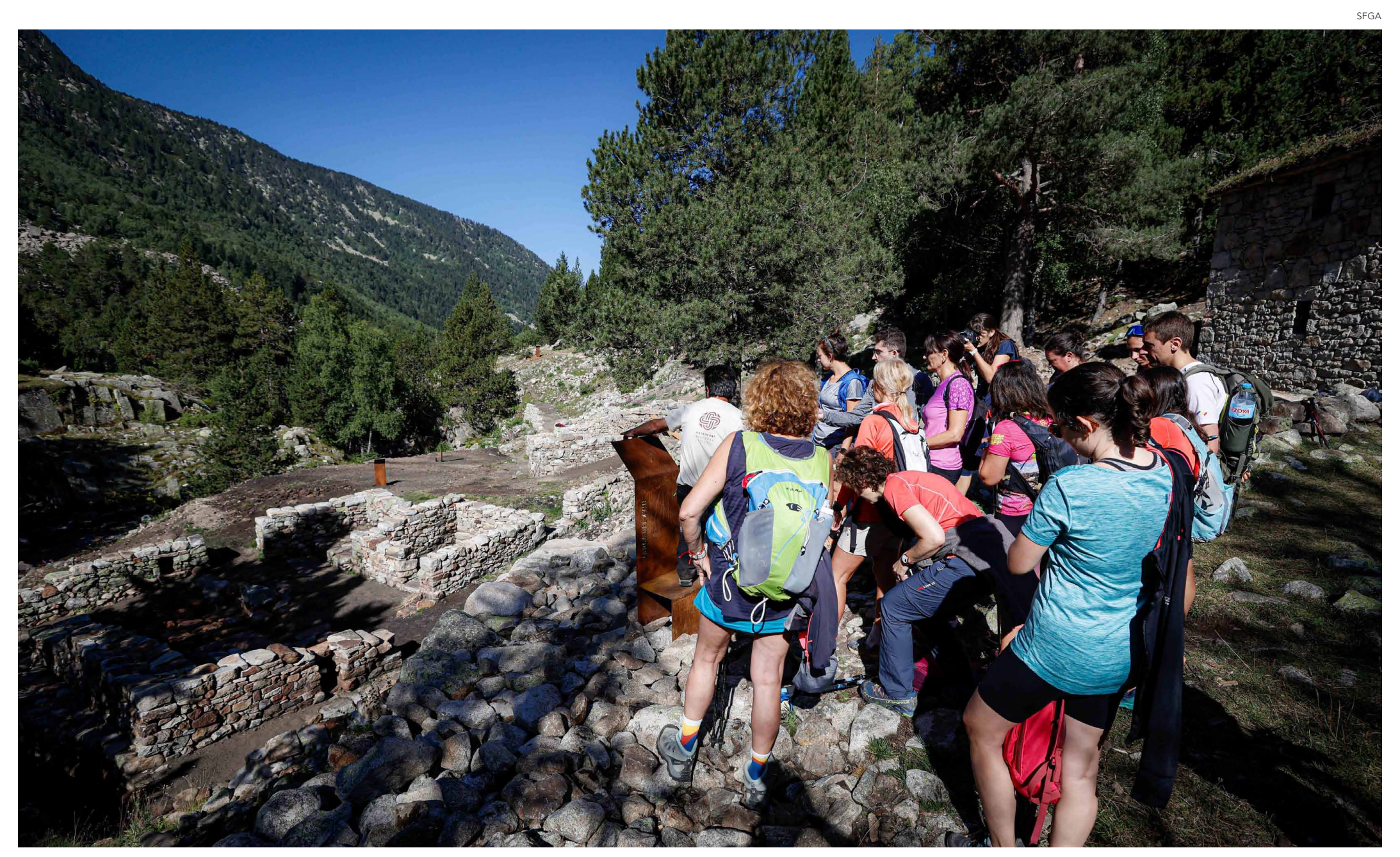
The Madriu forge yesterday morning, after concluding its remodeling.

Various authorities attend the guided tour on the occasion of the completion of the archaeological site